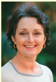
The Hon. Pru Goward MP Minister for Family and Community Services Minister for Women

Lastly, Christmas is almost here and I would like to take this opportunity to wish you all a happy holiday season and a very safe and happy new year.